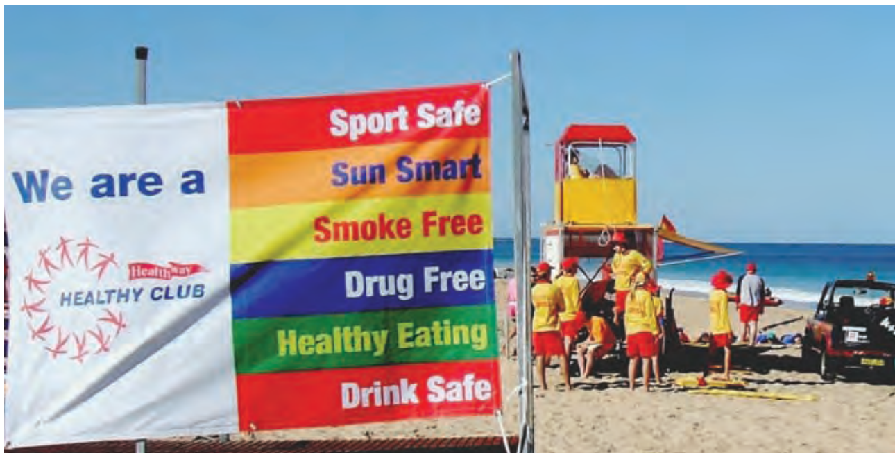
Dalyellup Surf Life Saving Club.