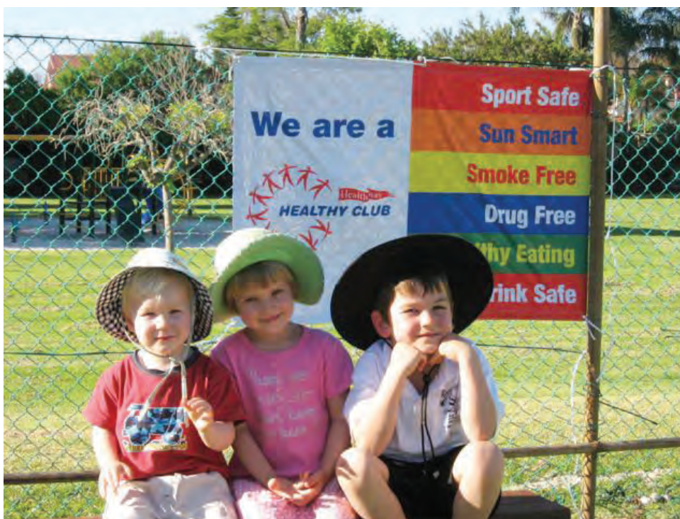
North Fremantle Bowls Club.