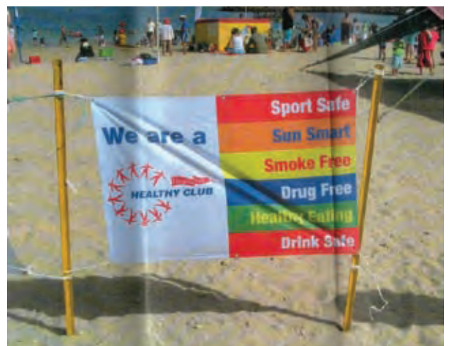
Broadwater Bay Surf Life Saving Club.