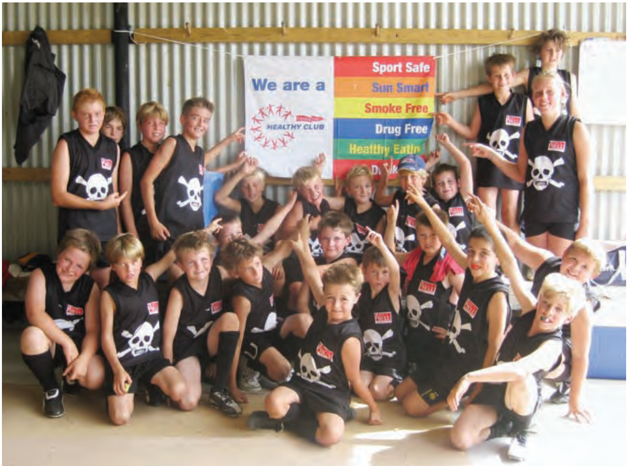
Lancelin Football Club.

http://www.google.com/Top/News/Newspapers/Regional/Australia/Western_Australia/